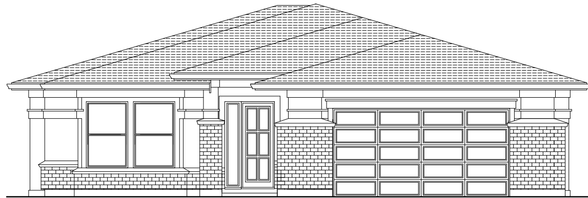
ELEVATION B FRONT ELEVATION