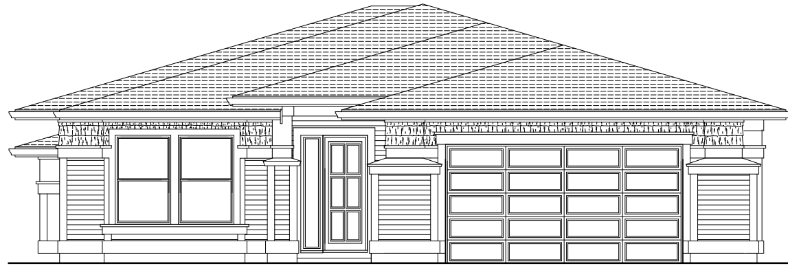
ELEVATION A FRONT ELEVATION